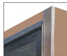
Patch End with replaceable front edge trim provides additional serviceability.