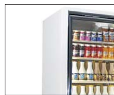
Patch-End with fixed edge trim.