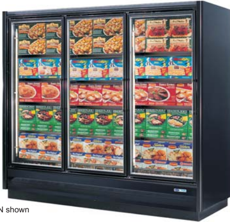
Model A5FGN shown

Alpine Series A5FGN narrow-depth glass door merchandisers have energy efficient coils for optimum low temperature operation, while allowing maximum product facings. Lighting options include vertical Prism T8 and LED lighting designed to promote maximum product illumination. The A5FGGB is configured as a back-to-back merchandiser for center-store or in-aisle layouts.