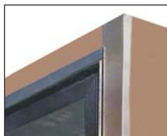
Patch End with replaceable front edge trim provides additional serviceability.