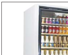
Patch-End with fixed edge trim.