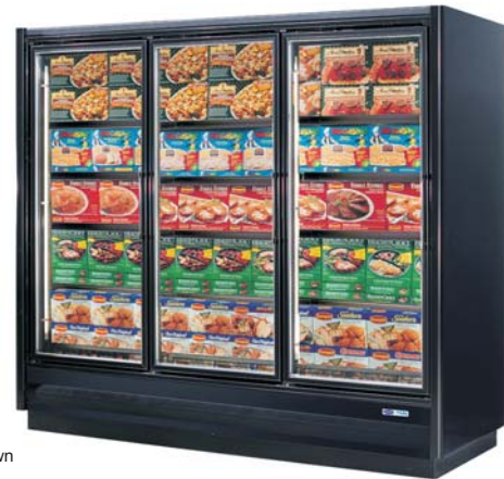
Model A5FGN shown