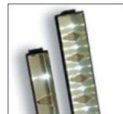
A choice between two types of High output LED lighting provides consistent product illumination while lowering case energy consumption.