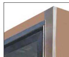
Patch End with replaceable front edge trim provides additional serviceability.