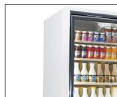
Patch-End with fixed edge trim.