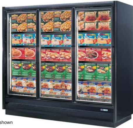
Model A5FGN shown

A5NGN Narrow-Depth, A5NGBB (back-to-back)