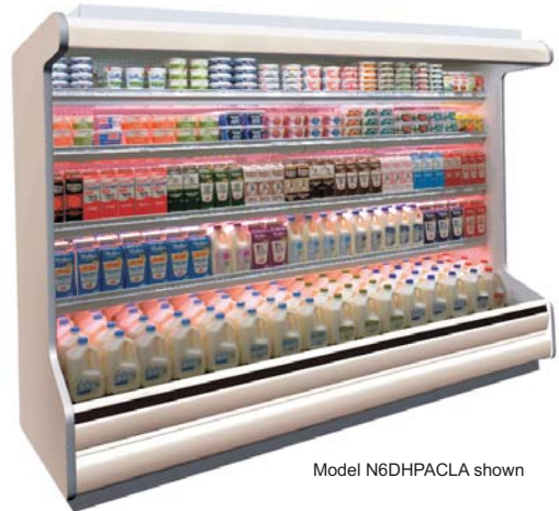
Model N6DHPACLA shown