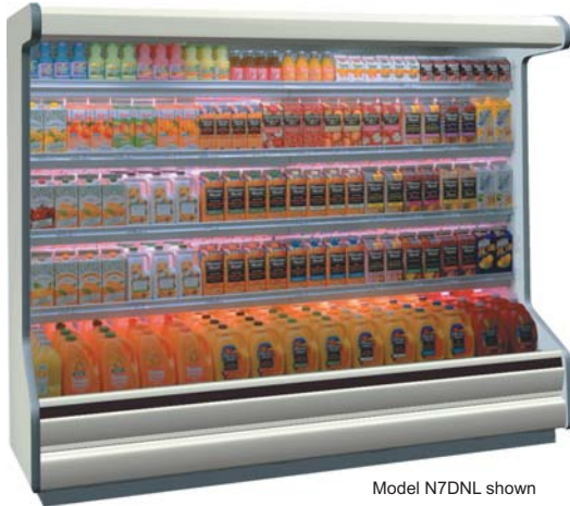
Model N7DNL shown