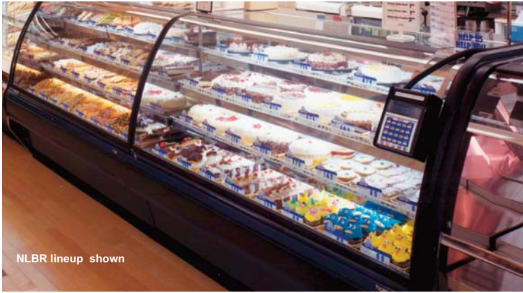
NLBR lineup shown