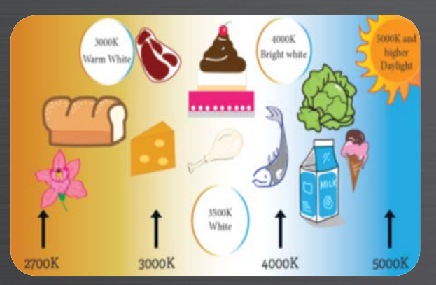
We look at Kelvin temperatures by department and store format.